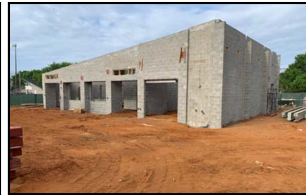
Catholic High STUDENT LIFE CENTER