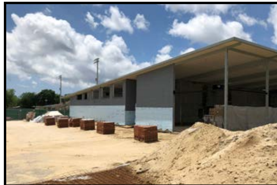
Catholic High FITNESS CENTER