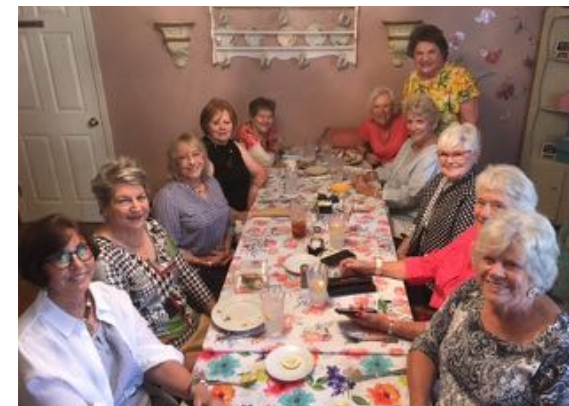
The Class of 1962 photo of one of their monthly DIVA Luncheons.

In 1969, the Crusader Football Team began the season with a new coaching staff that brought high expectations with it. The challenging schedule humbled the Crusaders with losses in the first 3 games though the second and third losses were by a total of only 4 points.